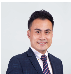
The Honourable KWOK Wai-keung, BBS, JP