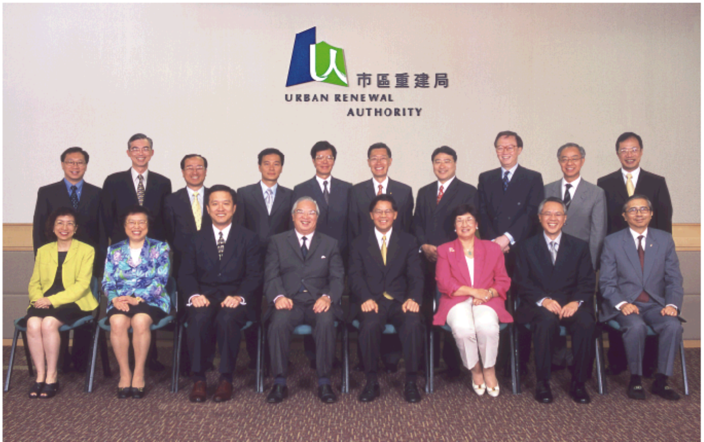
董事會成員 MEMBERS OF THE BOARD

攝於二零零三年五月二十九日。 Photo taken on 29 May 2003.