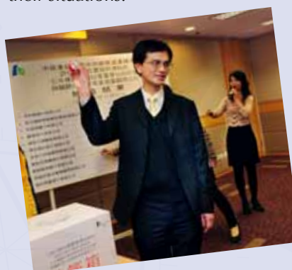
Balloting for selection of the valuation consultants to perform the assessment of a notional seven-year-old flat.