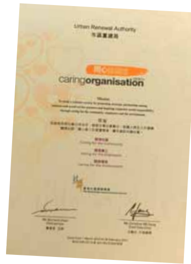
URA earns recognition from the Hong Kong Council of Social Services as a “Caring Organisation”.

During the year, URA was pleased to be nominated by two non-government organisations and to earn recognition from the Hong Kong Council of Social Services as a “Caring Organisation”. This status was granted to acknowledge to URA’s people-orientated approach to its work, the care it takes of its staff, the support given by URA and its Staff Club to charitable organisations, URA’s policy on environmentally sustainable development and its contribution to a greener community.