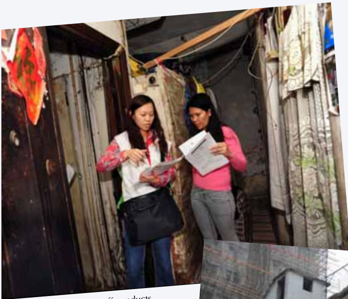
URA staff conducts freezing survey to ascertain the occupancy status.

In recognition of the unique circumstances, in particular the residents' psychological concern about the safety of their premises, the URA adopted special measures to help those affected residents in advance of completion of planning approval and issuances of formal acquisition offers. The special measures, which were valid for one month from the commencement of the project, were introduced to help owner-occupiers and tenants within the project leave as early as possible if they so wished. Owner-occupiers were offered deposits of