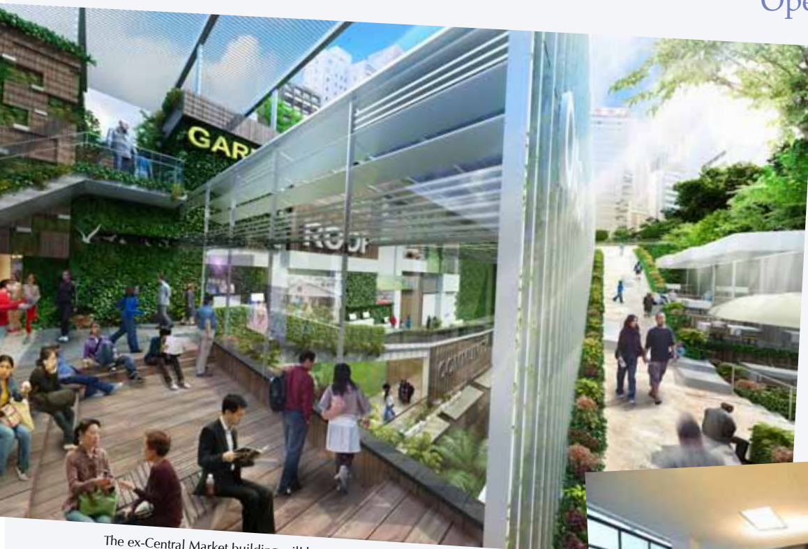
The ex-Central Market building will be converted into a green public open space.

Oasis refurbished with ample greenery, sufficient space for cultural and art activities, open air dining and affordable eateries for the public. The majority of respondents supported converting the roof into a green public open space and the need to refurbish the exterior and modify the interior of the market to enhance the attractiveness of the building. At the same time, the URA has started a structural survey to assess the structural integrity of the building so as to come up with structural improvement plans for the future use of the market. In the interim, the URA has proceeded with the following beautification measures, namely, covering the building with themed temporary cladding and creating a themed exhibition-cum-amenity area on the second floor pedestrian walkway level of the market building. All of these were installed and unveiled in February 2010. The exhibition-cum-amenity area has already hosted several exhibitions and a programme of further activities and exhibitions is being planned for the rest of 2010. The URA has also commissioned the Chinese University of Hong Kong's School of Architecture to conduct an in-depth study to help identify the "character defining elements" of the market and their significance