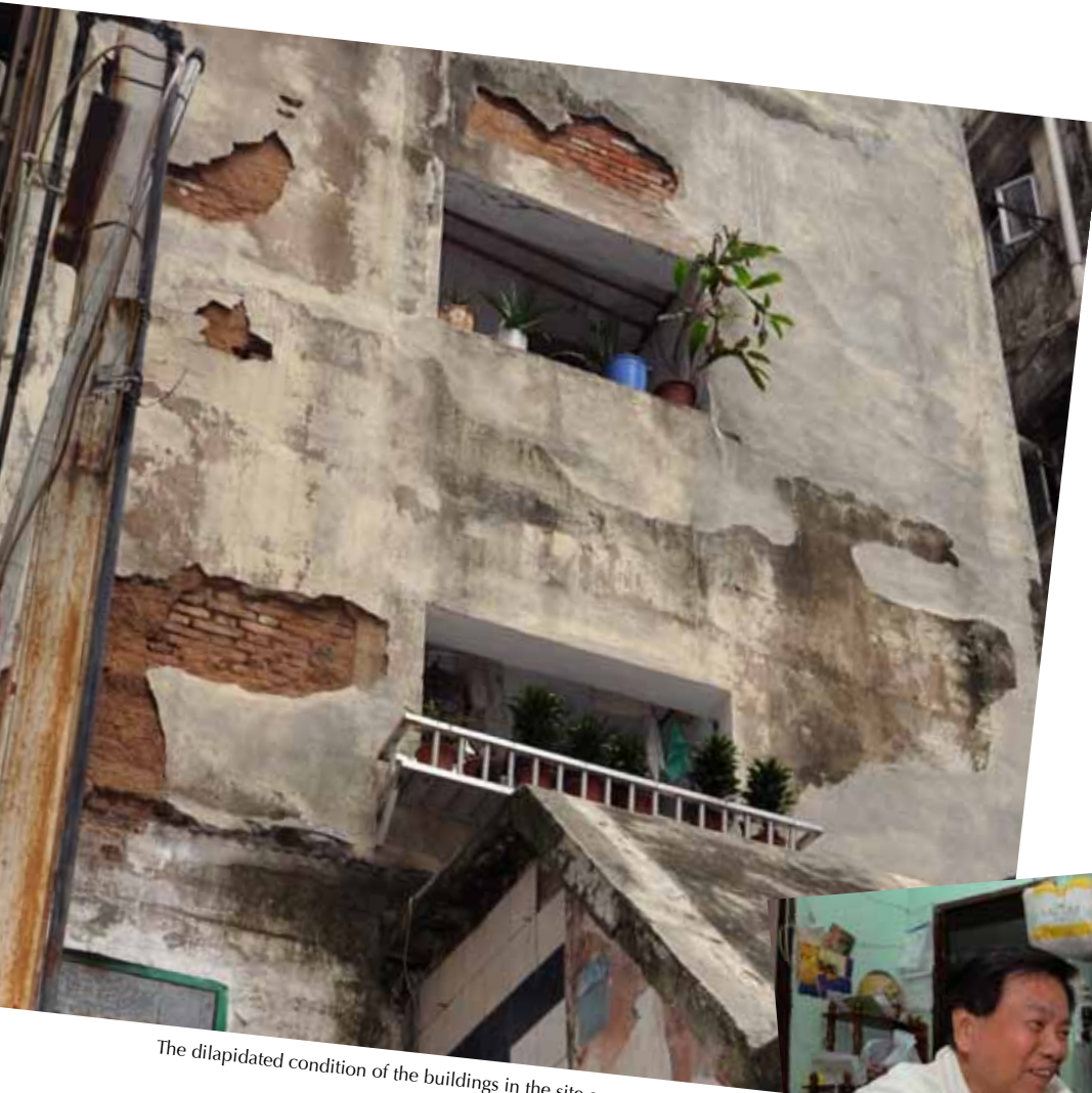
The dilapidated condition of the buildings in the site area.