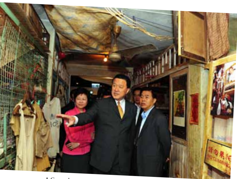
A Guangdong Province delegation led by the Governor Mr Huang Hua Hua (right) tours the Urban Renewal Exploration Centre.

URA also strengthened the URA website to tie in with the URS Review, OBB and Central Oasis revitalisation project. The popularity of the URA website as a source of up to date information on URA's work and policies increased during the year, with the website recording some 28,093,000 hits, an increase of 13% as compared to the number of hits in the previous year.