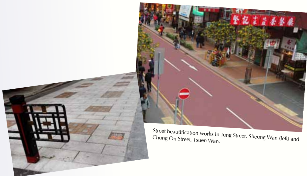
Street beautification works in Tung Street, Sheung Wan (left) and Chung On Street, Tsuen Wan.