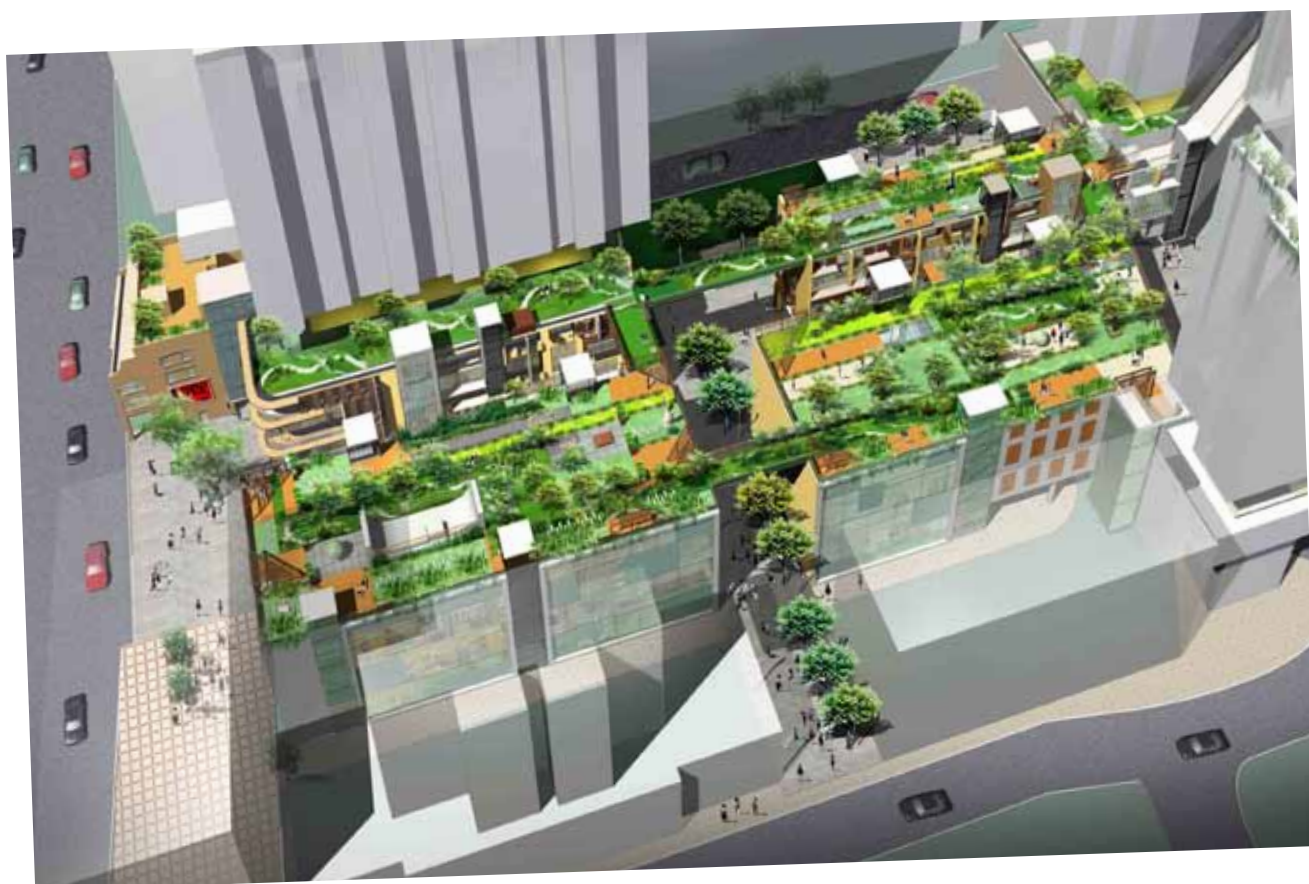
The project will provide about 3,000 squares of public open space.

will be closed and pedestrianised, and Amoy Street will be connected to Queen's Road East. Gazettal under the Roads (Works, Use and Compensation) Ordinance was completed in April 2009. Following consideration of objections received under the ordinance, Lee Tung Street was physically closed on 25 February 2010. Work on opening up Amoy Street will commence in due course. The Conservation Plan for the preservation and adaptive re-use of three pre-war shophouses on Queen's Road East was agreed with the AMO in April 2009. Expressions of interest in redeveloping the site were invited in March 2009, tenders were invited in May 2009 and the joint venture development tender was awarded in June 2009 with a view to completion of construction in 2015.