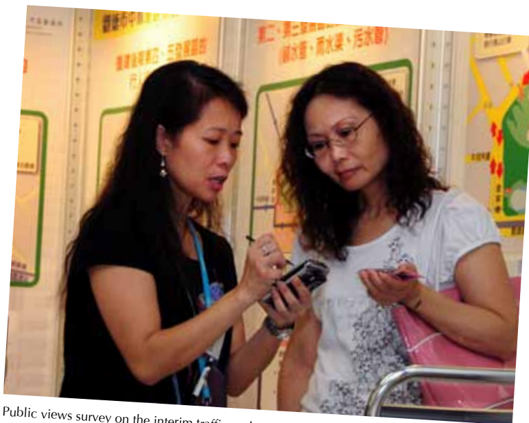
Public views survey on the interim traffic and transport arrangements is conducted at a road show.

Redevelopment of Development Area 1, the Yuet Wah Street Site, commenced in December 2009, after the existing bus terminus had been successfully relocated to the new one in Fuk Tong Road, which was designed and built by the URA and then transferred to the Government.