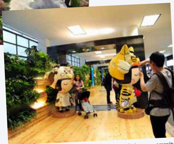
The public enjoy activities organised at the exhibition-cum-amenity area on the second floor pedestrian walkway level of the existing market building.

Oasis refurbished with ample greenery, sufficient space for cultural and art activities, open air dining and affordable eateries for the public. The majority of respondents supported converting the roof into a green public open space and the need to refurbish the exterior and modify the interior of the market to enhance the attractiveness of the building. At the same time, the URA has started a structural survey to assess the structural integrity of the building so as to come up with structural improvement plans for the future use of the market. In the interim, the URA has proceeded with the following beautification measures, namely, covering the building with themed temporary cladding and creating a themed exhibition-cum-amenity area on the second floor pedestrian walkway level of the market building. All of these were installed and unveiled in February 2010. The exhibition-cum-amenity area has already hosted several exhibitions and a programme of further activities and exhibitions is being planned for the rest of 2010. The URA has also commissioned the Chinese University of Hong Kong's School of Architecture to conduct an in-depth study to help identify the "character defining elements" of the market and their significance