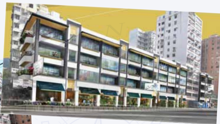
A Local Flower and School Shop Arrangement is introduced to the existing operators of the Prince Edward Road West / Yuen Ngai Street project.