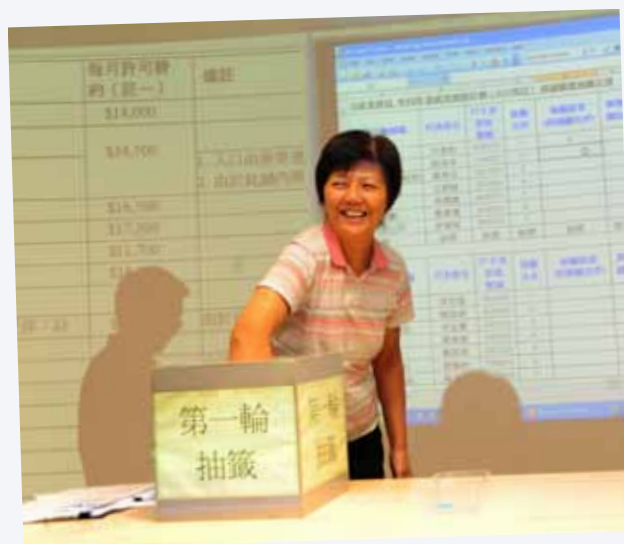
A balloting exercise for the allocation of affected shops in the interim.

The application for resumption of this project site has been submitted and approval is now awaited.