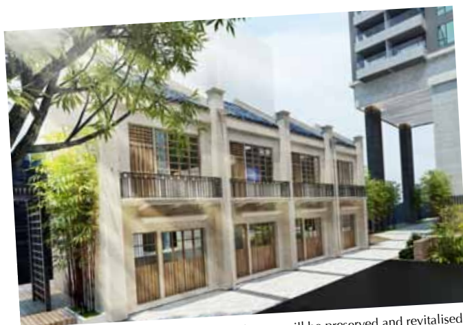
The tenement houses at No. 9 - 12 Yu Lok Lane will be preserved and revitalised.

Action plans for the potential preservation of a further 28 shophouses of lower but, nevertheless, significant heritage values, have also been drawn up. Ten of these shophouses, which were identified in the conservation strategy as having significant but lower levels of heritage value than those in the clusters in Mong Kok mentioned above, have been selected for potential preservation under new pilot voluntary acquisition scheme (VAS) and voluntary restoration scheme (VRS). During the past year, URA approached the owners of four shophouses to invite them to participate in our pilot VAS. In the event that any of these owners prefer to retain their ownerships of their shophouses, we will invite them to participate in our pilot VRS instead. Since July 2009, URA has approached the owners of 12 further shophouses to invite them to participate in our pilot VRS. URA is now liaising with the owners of two shophouses interested in voluntary acquisition as well as the owners of another two shophouses interested in voluntary restoration.