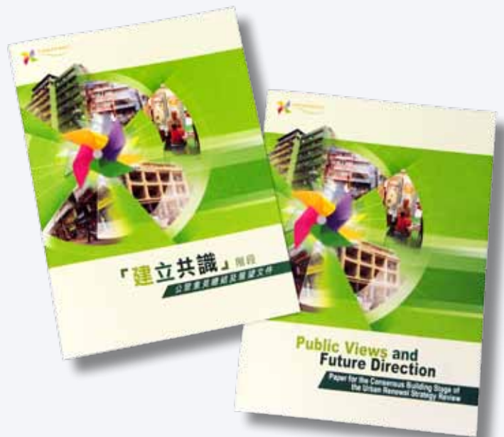
A public consultation paper is issued for the Consensus Building Stage of the URS Review.