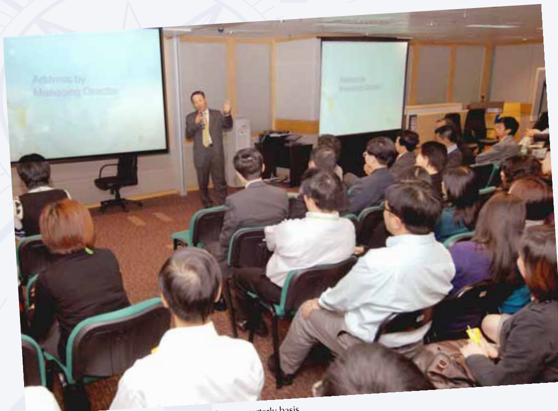
Staff communication and sharing session is held on a quarterly basis.