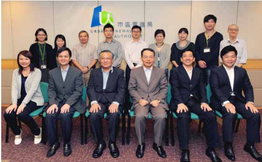
Members of the URA Staff Club for 2009/10 together with URA senior management.

The Staff Club organised a wide range of social, sports and community service activities to help build teamwork and to provide avenues for staff and their family members to relax, enjoy and utilize their leisure in a worthwhile manner. A total of 28 well received activities were arranged, attracting over 1,380 participants. Such activities are not only recreational in nature but also provide opportunities for participants to build and improve their relationships with family and to contribute to the community by taking up some voluntary and community service work.