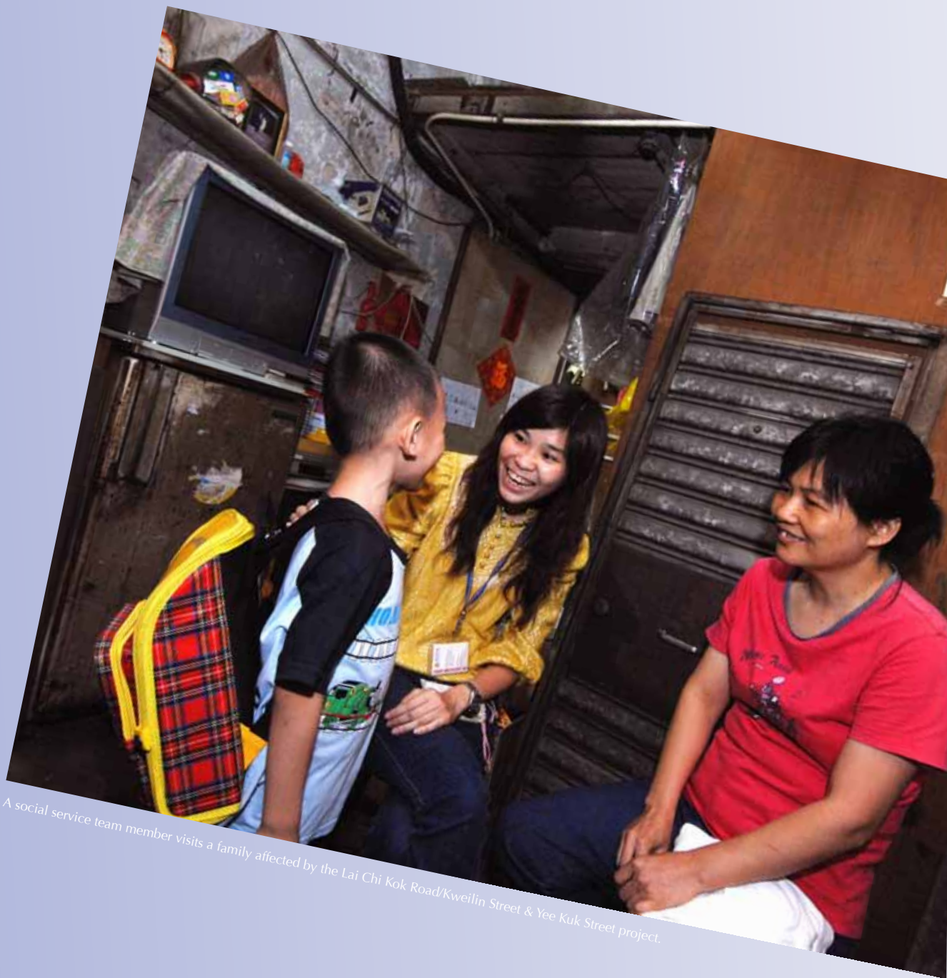
A social service team member visits a family affected by the Lai Chi Kok Road/Kweilin Street & Yee Kuk Street project.