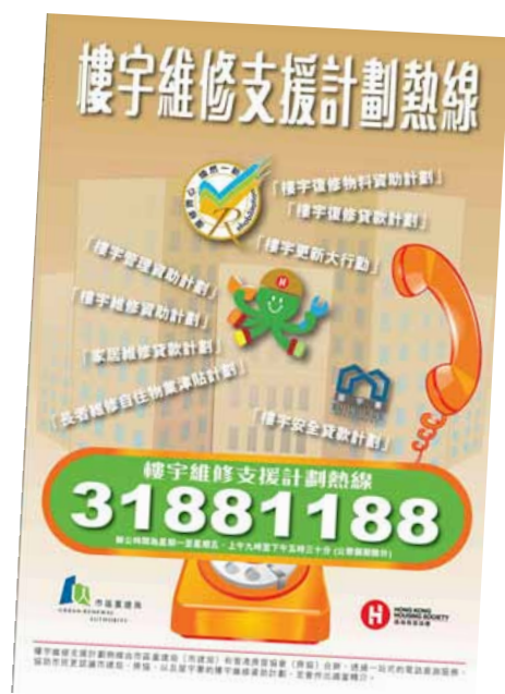
A common hotline providing one stop assistance service to the public has been set up.