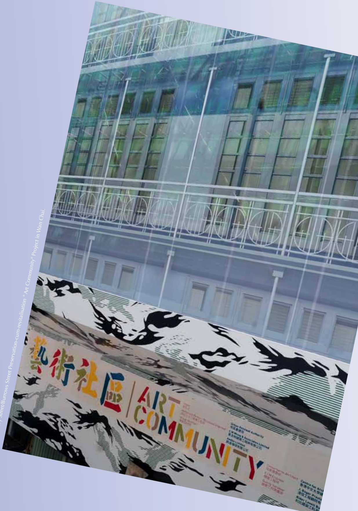
The Mallory Street/Burrows Street Preservation-cum-revitalisation "Art Community" Project in Wan Chai.