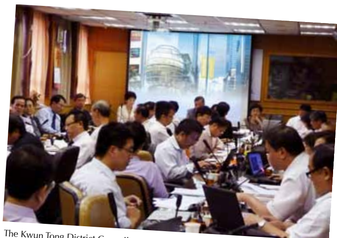
The Kwun Tong District Council meets to discuss matters on the Kwun Tong Town Centre Project.

the Government for diversion of underground utilities, the URA has decided to redevelop Development Areas 2 and 3 concurrently. This will meet the community's aspirations to speed up the redevelopment of this project. It will also improve the programming for re-provisioning of crucial GIC facilities, including advancing the completions of both the permanent hawker bazaar in Development Area 3 and the integrated covered public transport interchange which straddles across Development Areas 2 and 3.