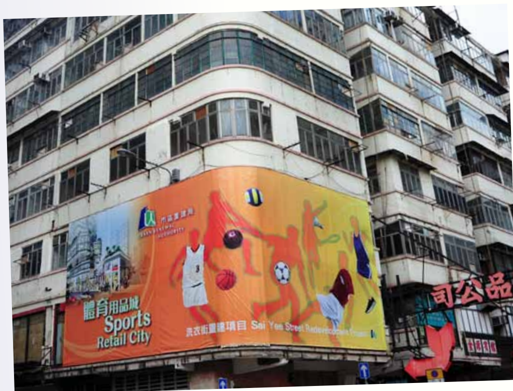
The "Sports Retail City" will form a special feature of the new development.

General acquisition offers were made to all affected domestic and non-domestic owners in March 2008 and the application for resumption has been submitted.