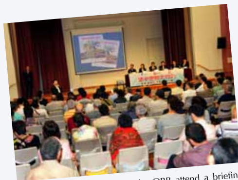
Owners of buildings joining the OBB attend a briefing jointly organised by the URA, HKHS and ICAC.

Up till the end of July 2010, over 200 buildings had commenced and, in some cases, had completed their rehabilitation works within URA's Scheme Areas. The URA currently anticipates that about 1,300 buildings in the URA's Scheme Areas will be rehabilitated by the time that this programme is completed in 2014.