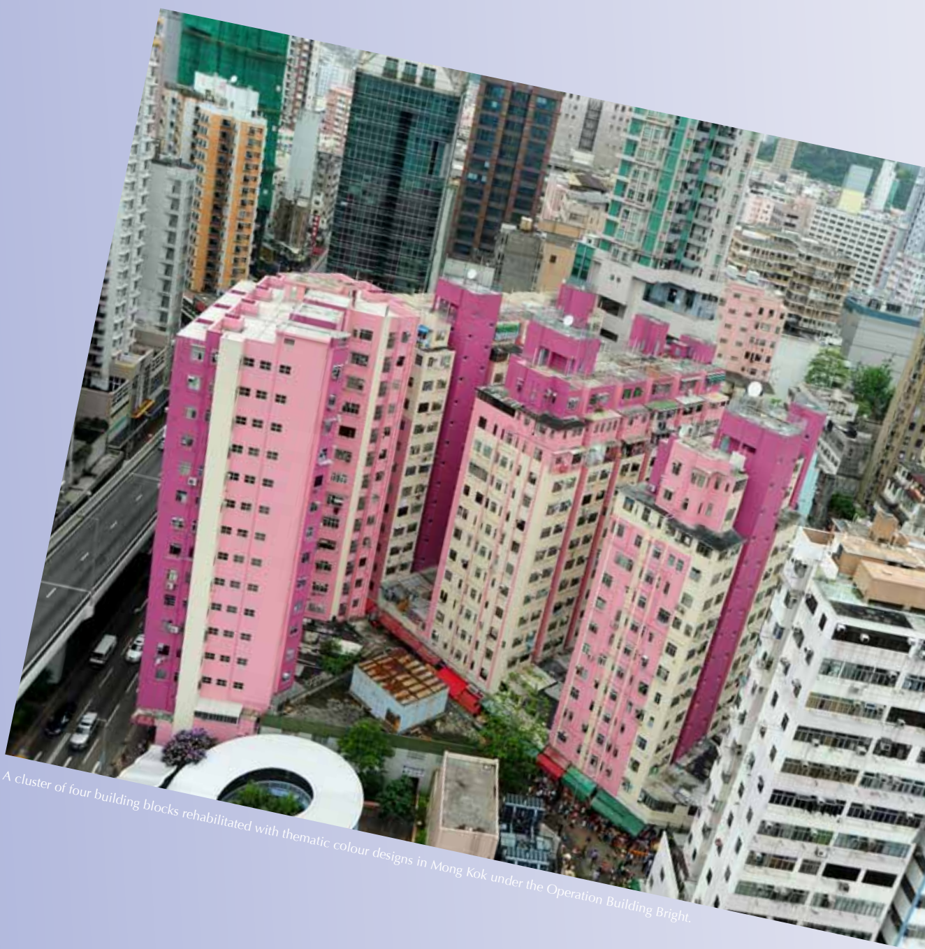
A cluster of four building blocks rehabilitated with thematic colour designs in Mong Kok under the Operation Building Bright.