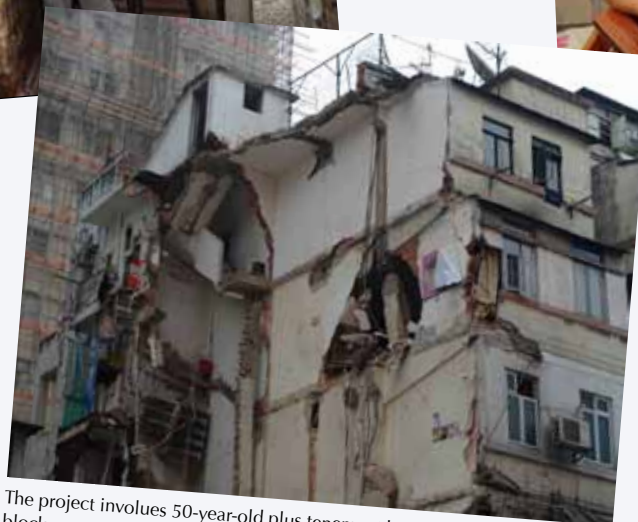
The project involves 50-year-old plus tenement buildings at a site where a block was tragically collapsed.