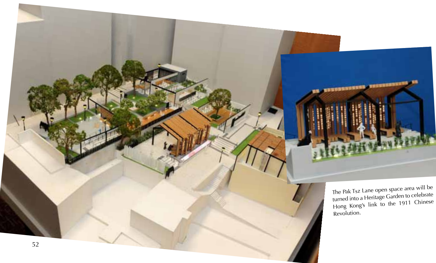
The Pak Tsz Lane open space area will be turned into a Heritage Garden to celebrate Hong Kong's link to the 1911 Chinese Revolution.

In response to the CE's 2009/10 Policy Address, the URA will be revitalising the currently under-utilised Central Market building to turn it into a new Central Oasis. An advisory committee, the Central Oasis Community Advisory Committee (COCAC), comprising members from the Central and Western District Council, professionals and relevant stakeholders has been set up to advise the URA in the process. It is currently estimated that that it will cost the URA about $500 million to renovate, refurbish and adapt the market for an appropriate mix of uses to meet the wish and aspirations of the residents in the neighbourhood, those working in Central and also visitors. To solicit the views of the public, the URA completed both an on-street poll and an e-Poll, through a dedicated website, in February 2010. The results of the opinion poll, which involved some 6,000 people, were published on 31 May 2010. Overall, those surveyed would like to see the Central