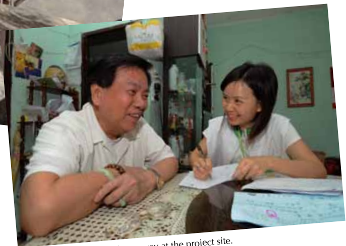
URA staff conducts freezing survey at the project site.