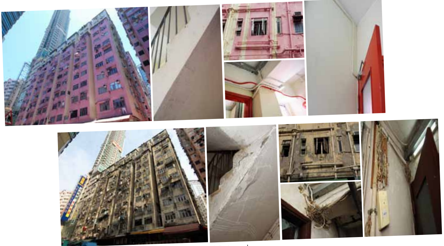
The Cheung Hing Building in Mong Kok before and after rehabilitation work.