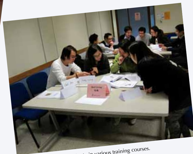
URA staff members participate in various training courses.