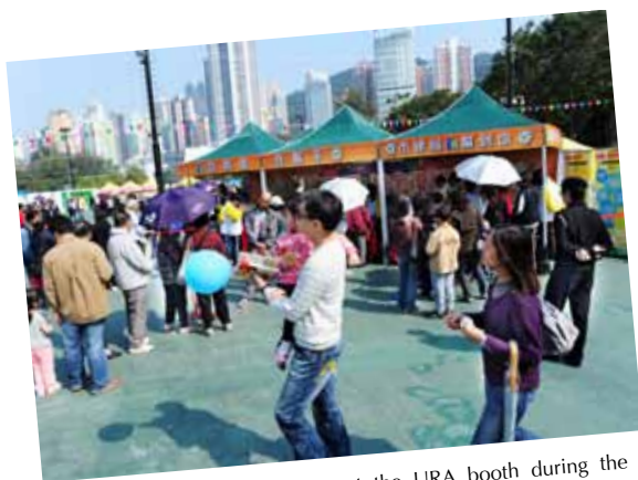
Participants enjoying the game at the URA booth during the Building Safety Carnival jointly organised by the URA, the Buildings Department and the HKHS.

building rehabilitation partnership model, comprising the BD, URA and HKHS. Once the legislation is passed and comes into force, the URA will provide financial assistance and technical advice to building owners in need in its Scheme Areas to comply with the statutory requirements and establish OCs.