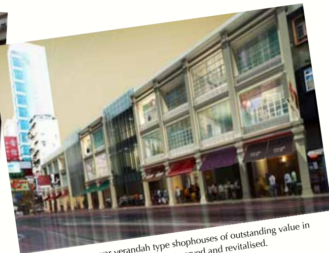
A cluster of 10 pre-war verandah type shophouses of outstanding value in Shanghai Street/Argyle Street will be preserved and revitalised.