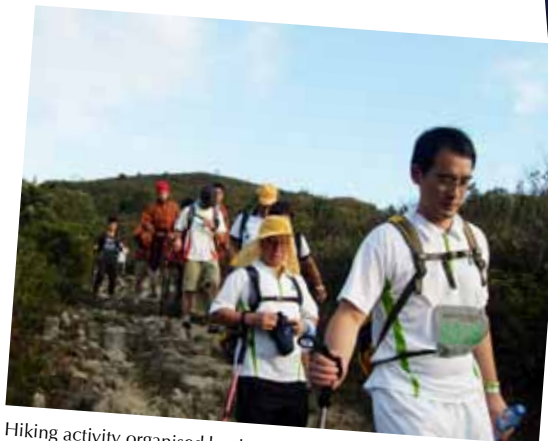
Hiking activity organised by the Staff Club.

The Staff Club organised a wide range of social, sports and community service activities to help build teamwork and to provide avenues for staff and their family members to relax, enjoy and utilize their leisure in a worthwhile manner. A total of 28 well received activities were arranged, attracting over 1,380 participants. Such activities are not only recreational in nature but also provide opportunities for participants to build and improve their relationships with family and to contribute to the community by taking up some voluntary and community service work.