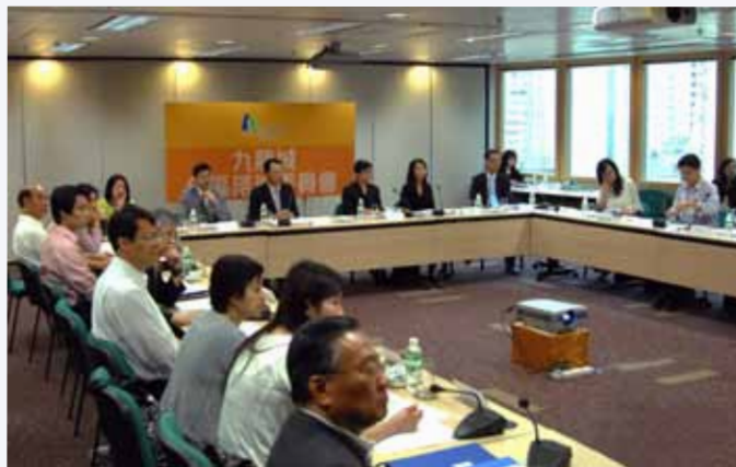
Meeting of the URA Kowloon City District Advisory Committee.

The URA is fully aware of the importance and benefits of effective community relations and has been reaching out to the local communities in the URA’s Action Areas as an integral part of its people-oriented community engagement strategy. Intensive effort continues throughout the year to engage all relevant stakeholders with a view to ensuring that the sentiments and concerns of stakeholders in individual projects are taken into consideration during the planning and acquisition stages of such projects. The URA reaches out to all resident groups, business operators, concern groups, local consultative bodies, educational institutions, professional bodies, politicians, and the mass media to cultivate and foster better mutual understanding with all stakeholders, to address their legitimate concerns as far as practicable and to enlist both local and general public support.