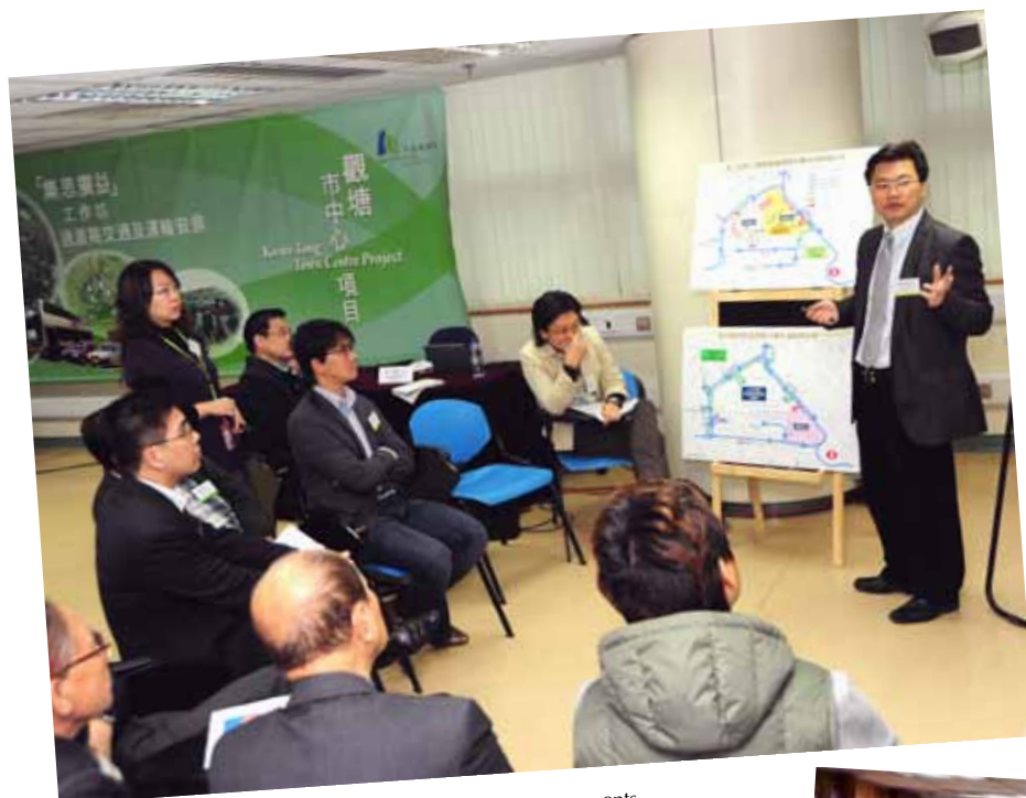
A workshop on the interim traffic and transport arrangements.