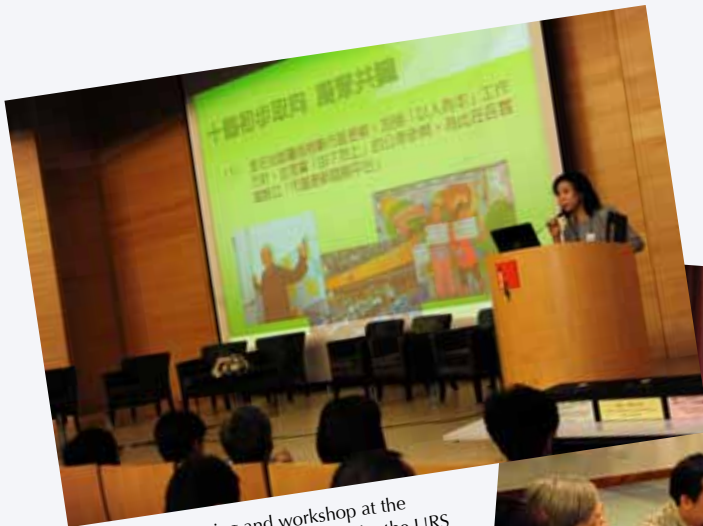
Concluding Meeting and workshop at the Consensus Building Stage are held for the URS Review.