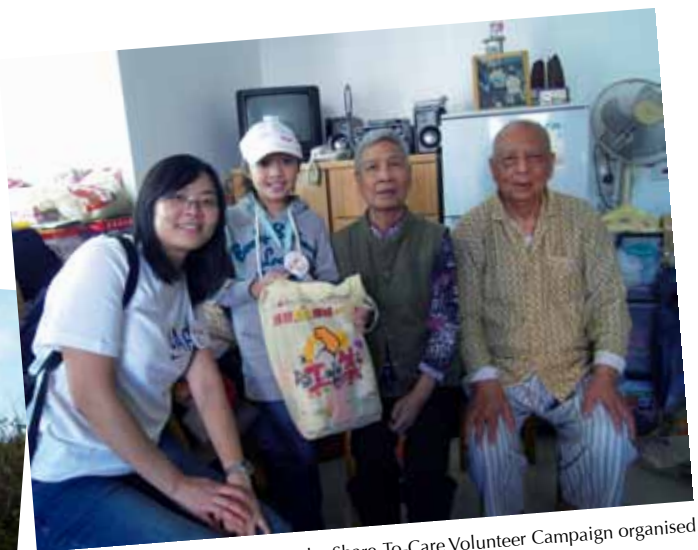
URA staff visit the elderly under the Share-To-Care Volunteer Campaign organised by a local bank.