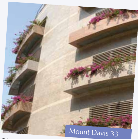
Mount Davis 33